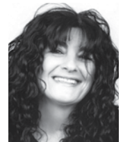
Ruth Reichl Magazines Editor-in-Chief Gourmet Magazine