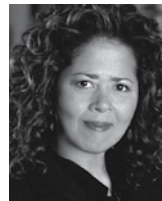
Anna Deavere Smith Arts & Entertainment Actress, Playwright, Teacher and Author