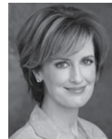
Anne Sweeney Television Co-Chair, Disney Media Networks and President, Disney-ABC Television Group