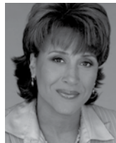
Robin Roberts Broadcasting News Anchor ABC News