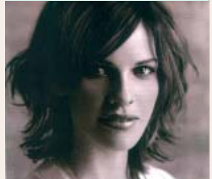
Hilary Swank Actress

A native of Bellingham, Washington, Hilary Swank won the Academy Award for Best Actress for her performance in Boys Don't Cry , as well as the Golden Globe and the Independent Spirit Award. She has appeared in The Gift , The Affair of the Necklace , Insomnia and The Core . Most recently, she starred in the HBO drama, Iron Jawed Angels that premiered in February. Also in February, Swank finished shooting Red Dust , which filmed on location in South Africa. She currently lives in New York with her husband, Chad Lowe.