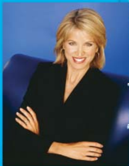
Anchor, CNN-Paula Zahn Now