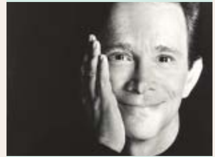
Joel Grey Actor

Joel Grey has impressed critics and audiences alike with his performances in virtually every medium of entertainment—stage, screen, concert venues, and television. He is best known for his Tony and Academy award-winning performances as the Master of Ceremonies in both the stage and film productions of Cabaret .