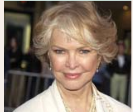
Ellen Burstyn Actress

Ellen Burstyn's illustrious career has encompassed the stage, film and television. She began as a model and actress, appearing regularly on television on the Jackie Gleason Show as well as The Doctors , Ben Casey and Iron Horse .