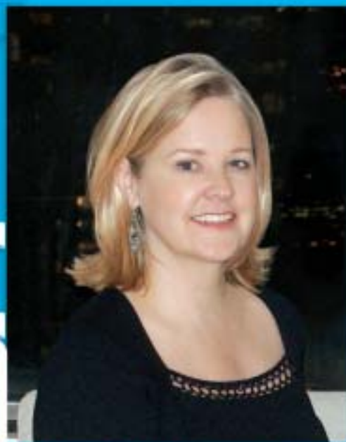
Managing Editor, PEOPLE magazine