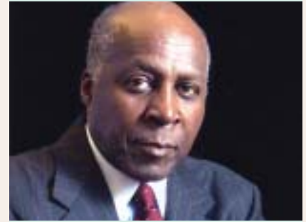
Vernon E. Jordan, Jr. Senior Managing Director of Lazard Frères & Co. LLC

Vernon E. Jordan, Jr. is a Senior Managing Director of Lazard Frères & Co. LLC in New York. Jordan was a Senior Executive Partner with the law firm of Akin, Gump, Strauss, Hauer & Feld, L.L.P., Washington, D.C., where he remains Of Counsel.