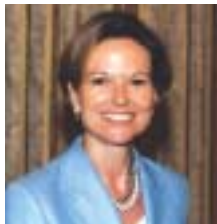
KATI MARTON Matrix winner, Books, 2002

I was offered another job at a tremendous salary. I didn't want to leave my present job, so I approached my boss and asked him if he would match the offer. Of course, they didn't, and my boss told me, 'Sometimes you have to leave the company and be asked to come back.' Well, he proved to be right. I was asked to re-join the company at the top of the department. And I didn't have the least bit of interest. I had moved way beyond."