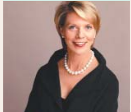
Cathleen P. Black President, Hearst Magazines

Dubbed "The First Lady of American Magazines," by The Wall Street Journal and "one of the leading figures in American publishing over the past two decades" by the Financial Times —Cathleen Black heads Hearst Magazines, a division of The Hearst Corporation and the world's largest publisher of monthly magazines. She oversees the financial performance and development of some of the industry's best-known titles: Cosmopolitan , CosmoGIRL! , Esquire , Good Housekeeping , Harper's BAZAAR , Marie Claire , O, The Oprah Magazine , Popular Mechanics , Redbook , and Town & Country . She also oversees 115 international editions in 100+ countries.