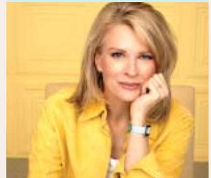
Candice Bergen Actress

Candice Bergen starred in the critically acclaimed CBS comedy "Murphy Brown," for which she received five Emmy awards and two Golden Globe awards for her role as 'Murphy'. Candice had earlier received extraordinary critical and audience responses for her performance as a college student caught up in turmoil of a campus revolt in "Getting Straight," as the personification of the clean cut all-American dream girl of the '40's in Mike Nichols' "Carnal Knowledge," and as the newly liberated wife in "Starting Over," for which she received an Oscar nomination for Best Supporting Actress.