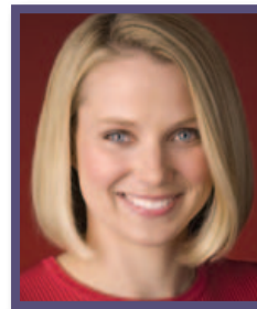
MARISSA MAYER Vice President, Search Products & User Experience, Google