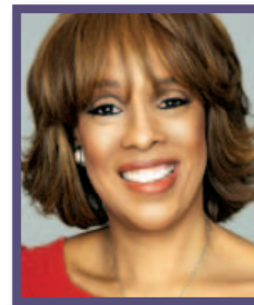
GAYLE KING Editor at Large, O, The Oprah Magazine and Host, "The Gayle King Show" on Sirius XM