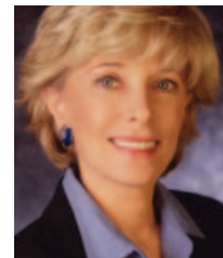
LESLEY STAHL "60 Minutes" and CBS News Correspondent