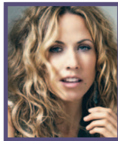
SHERYL CROW Grammy Award-winning Singer/Songwriter