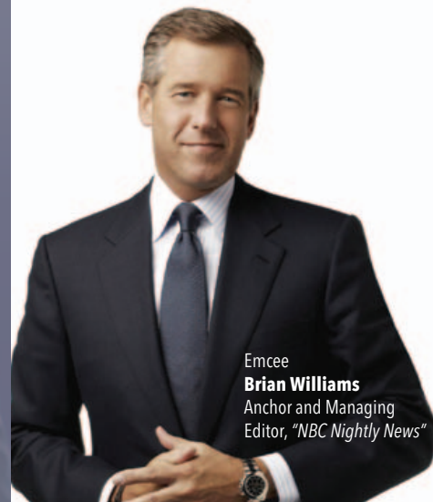
Emcee Brian Williams Anchor and Managing Editor, "NBC Nightly News"