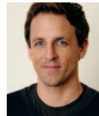
SETH MEYERS Head Writer and Weekend Update Anchor "Saturday Night Live"