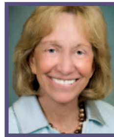
DORIS KEARNS GOODWIN Pulitzer Prize-winning Author and Presidential Historian