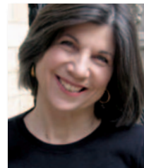
ANNA QUINDLEN Bestselling Author and Pulitzer Prize-winning Journalist