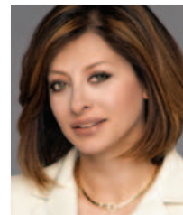
MARIA BARTIROMO Anchor, CNBC's "The Closing Bell" Host and Managing Editor, "The Wall Street Journal Report with Maria Bartiromo"