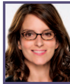
TINA FEY Executive Producer, Head Writer, Star, NBC's Three Time Emmy Award-winning "30 Rock"