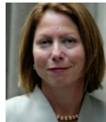
JILL ABRAMSON Managing Editor The New York Times