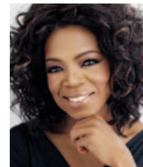
OPRAH WINFREY Chairman Harpo, Inc.