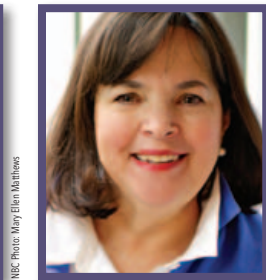
INA GARTEN Author and Host, Emmy Award-winning Food Network Program, "Barefoot Contessa"