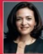
Sheryl Sandberg Chief Operating Officer Facebook