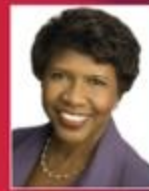
Gwen Ifill Moderator and Managing Editor "Washington Week" Senior Correspondent "The PBS NewsHour"