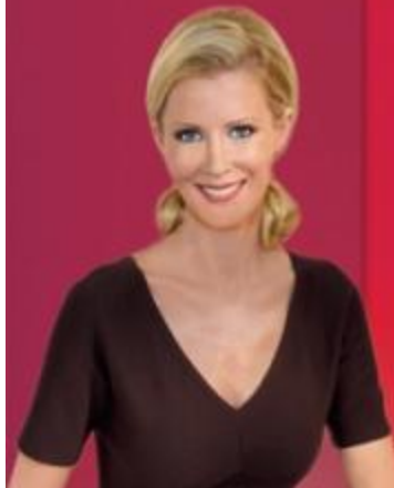
Emcee: Sandra Lee Editor in Chief, Semi-Homemade Magazine New York Times bestselling author and Food Network celebrity

Individual tickets, information on sponsorships and advertising opportunities are now available at www.nywici.org .