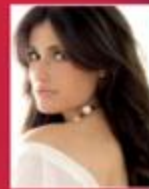
Idina Menzel Tony Award-winning Performer